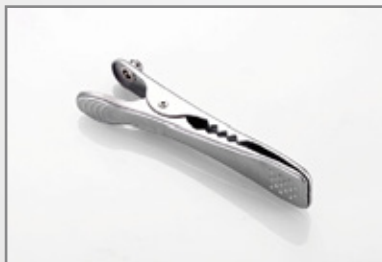
ECG: ECG crocodile clips will prevent falling and ensure signal stability