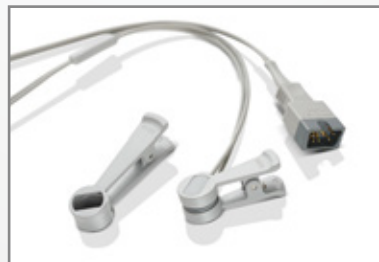
SpO2: Clips for animal tongue and ear