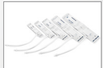
NIBP: Multi-size cuffs for different animals